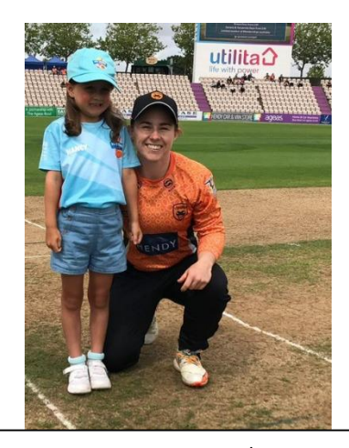
Nancy as a mascot at the Southern Vipers vs Western Storm (women's cricket match at the Ageas bowl)